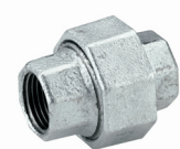
RTD-BR bypass restrictor