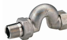
RTD-CB back-flow restrictor

The Renovation+ Solution makes it possible to renovate old, one-pipe systems and improve indoor comfort, reduce overheating in buildings, and reduce energy costs. Please contact your local Danfoss Company for more information on the Renovation+ Solution.